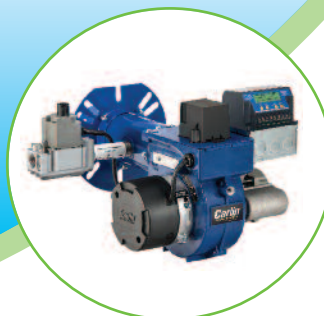
Carlin EZ Gas Burner