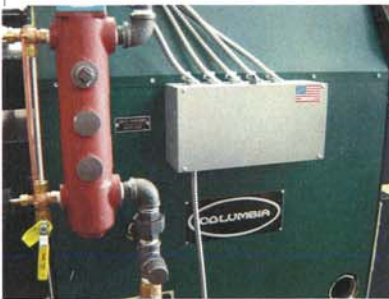
NEW MPH PANEL BOX FOR STEAM BOILERS