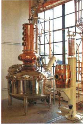
Columbia Builds Boilers for Breweries and Distilleries